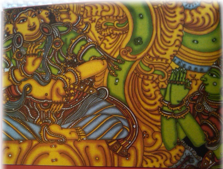
Lord Brahma imparting the knowledge of Ayurveda to his disciple, Daksha Prajapati