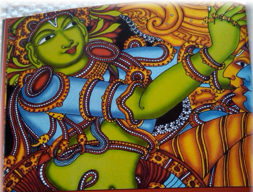
Daksha Prajapati conveys the Ayurvedic knowledge to Aswins, the twin gods