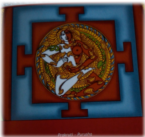
Image 1 - “ Prakruti and Purusha. ” Ayurveda. The mantra of niramaya